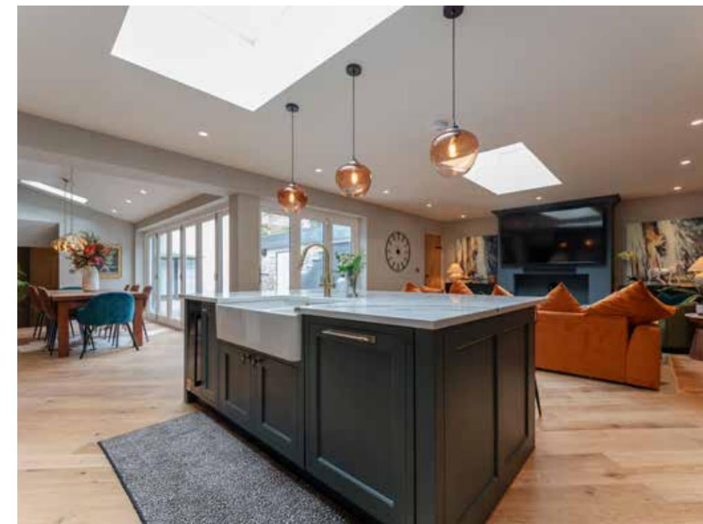
ABOVE With three inviting living areas and three fireplaces, there's ample space for everyone to relax